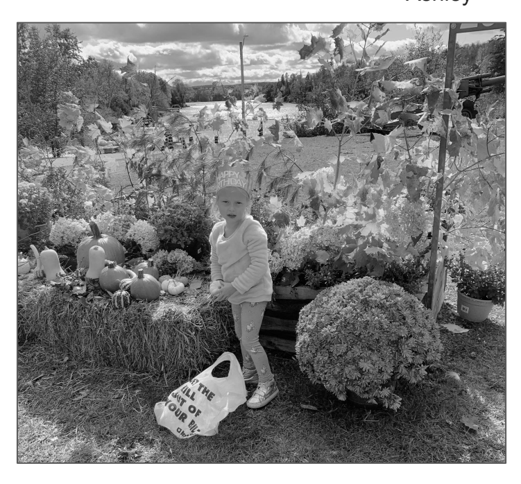
Decorating the Community Garden for Fall in October by WPS Junior Class

Sora is a web-based platform that allows all students to access our huge digital eLibrary collection and has an accompanying mobile app as well. You can find information and resources at <a href="library.rcdsb.on.ca">library.rcdsb.on.ca</a>