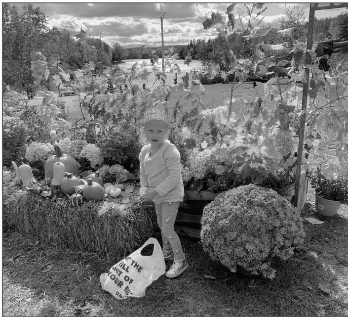
Decorating the Community Garden for Fall in October by WPS Junior Class

Sora is a web-based platform that allows all students to access our huge digital eLibrary collection and has an accompanying mobile app as well. You can find information and resources at library.rcdsb.on.ca